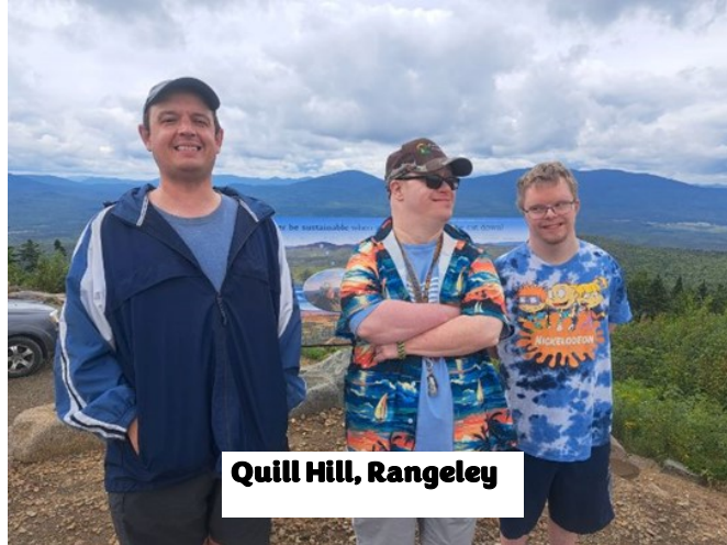
Quill Hill, Rangeley