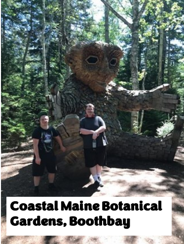
Coastal Maine Botanical Gardens, Boothbay

Community Life has had a very busy Summer! In addition to their regular group activities in the community, program participants had many adventures throughout the state!