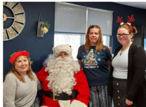
PVI & RLE staff posing with Santa!