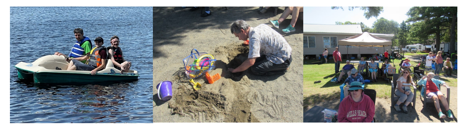
When not at Camp, we were still soaking up the last bit of summer sun!

Throughout August, participants at PVI and RLE were invited to Camp Week at Pushaw Lake Campground by Amicus Bouchea Center for Learning. At Camp, we were able to go swimming, soak up the sun, and even eat some s'mores. Thank you to everyone involved for making it a great week!