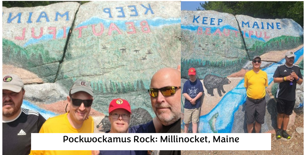
Pockwockamus Rock: Millinocket, Maine