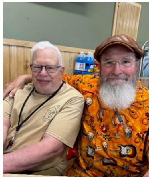
Dinner out with staff and peers!

If you would like future newsletters emailed to you, you may contact us at the address or telephone number above with your address.