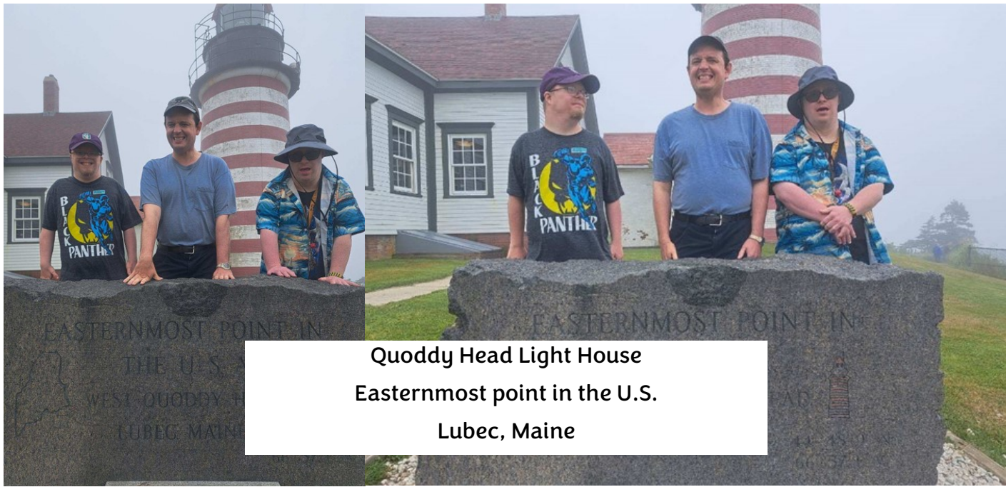
Quoddy Head Light House Easternmost point in the U.S. Lubec, Maine