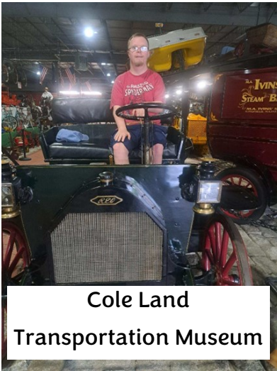
Cole Land Transportation Museum