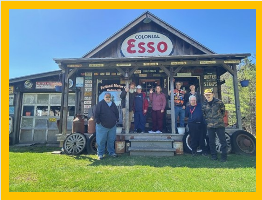
Ferland Motor Company—Hudson, Maine

Participants have been enjoying the weather and exploring the community and all it has to offer!