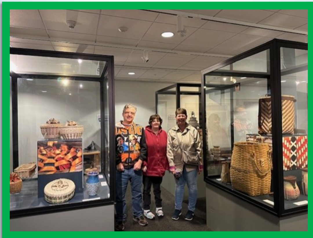
Hudson Museum—Collins Center for the Arts Orono, Maine