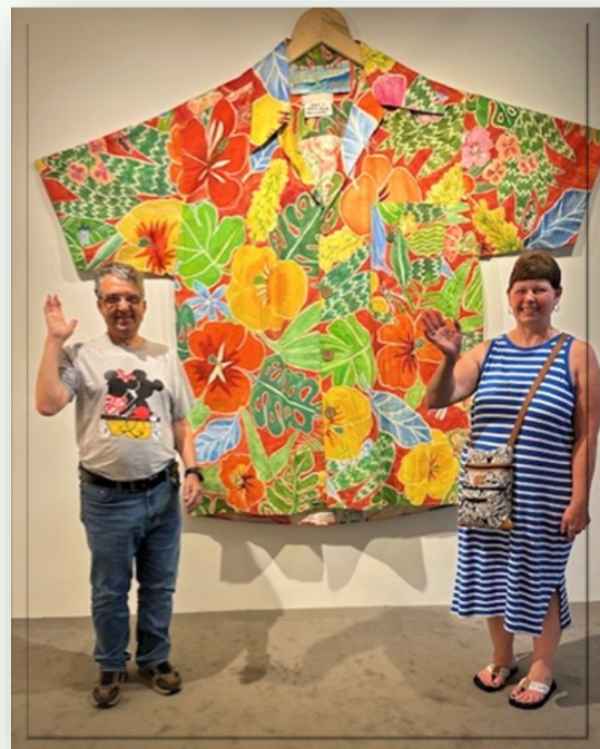
Zillman Art Museum